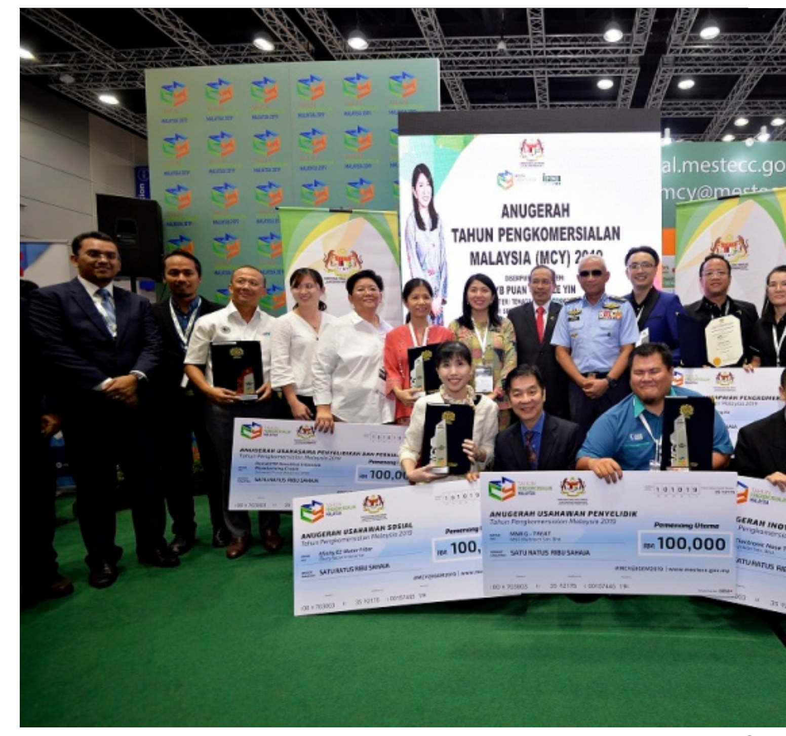
MNRg-Treat has been licenced and commercialised under a start-up company called MNR Multitech Sdn. I

Meanwhile, the UMP e-Nose technology has been developed to replace the use of human and animal nose