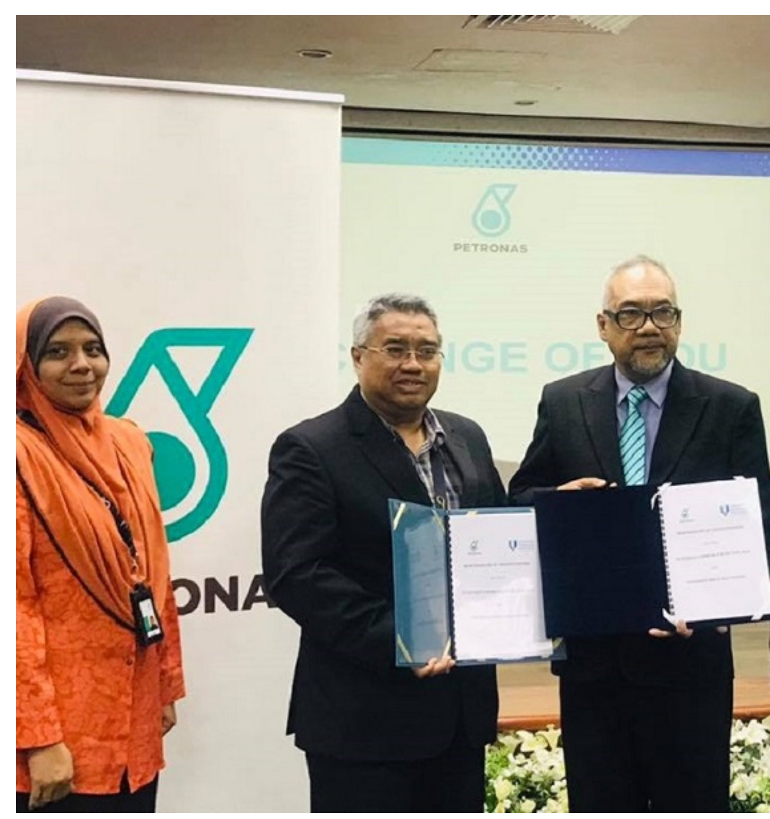
Universiti Malaysia Pahang (UMP) recently signed a Memorandum of Understanding (MoU) with Petronas