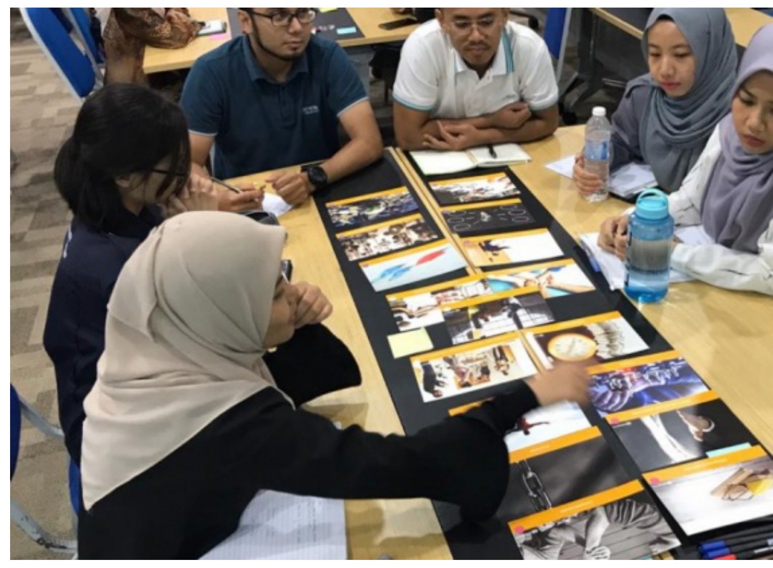
By: NOOR SYAHIDAH SABRAN, ENTREPRENEURSHIP CENTRE

Entrepreneurship Centre (MyPACE), Universiti Malaysia Pahang (UMP) organised a programme on awareness on the subject matter among its students, equipping them with the necessary knowledge about the national agenda on entrepreneurship.