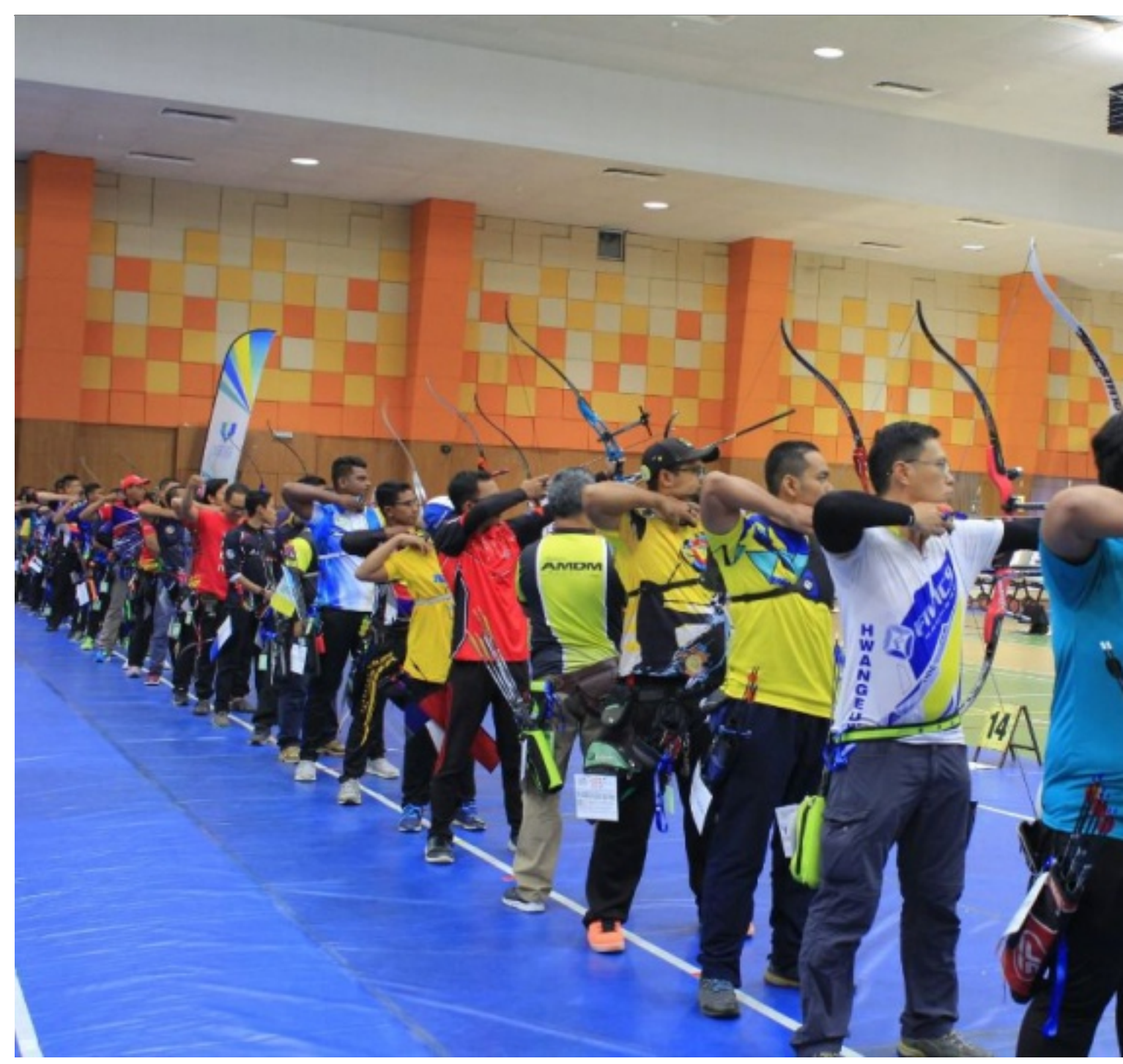
"We hope this tournament will be continued in the future and get financial support from UMP and sponso more international participants," he said.

He added that the tournament indirectly promoted UMP at the international level.