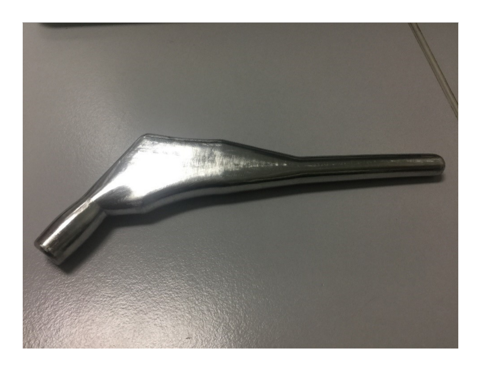
Figure 2: Successful printed hip femoral implant

The skill and higher level of learning in additive manufacturing can be included in the TVET national agenda. This skill can meet the country's demand for highly skilled workers. The 3D printing products can be imported or used in the internal market. Malaysia should focus on this area more critically and impart the skill to the young generation. Three critical subjects can be targeted in the higher level TVET skill for 3D printing process which are (1) types of the 3D printing process, (2) the software used for the interaction with 3D printers, and (2) variety of raw materials (Figure 3).