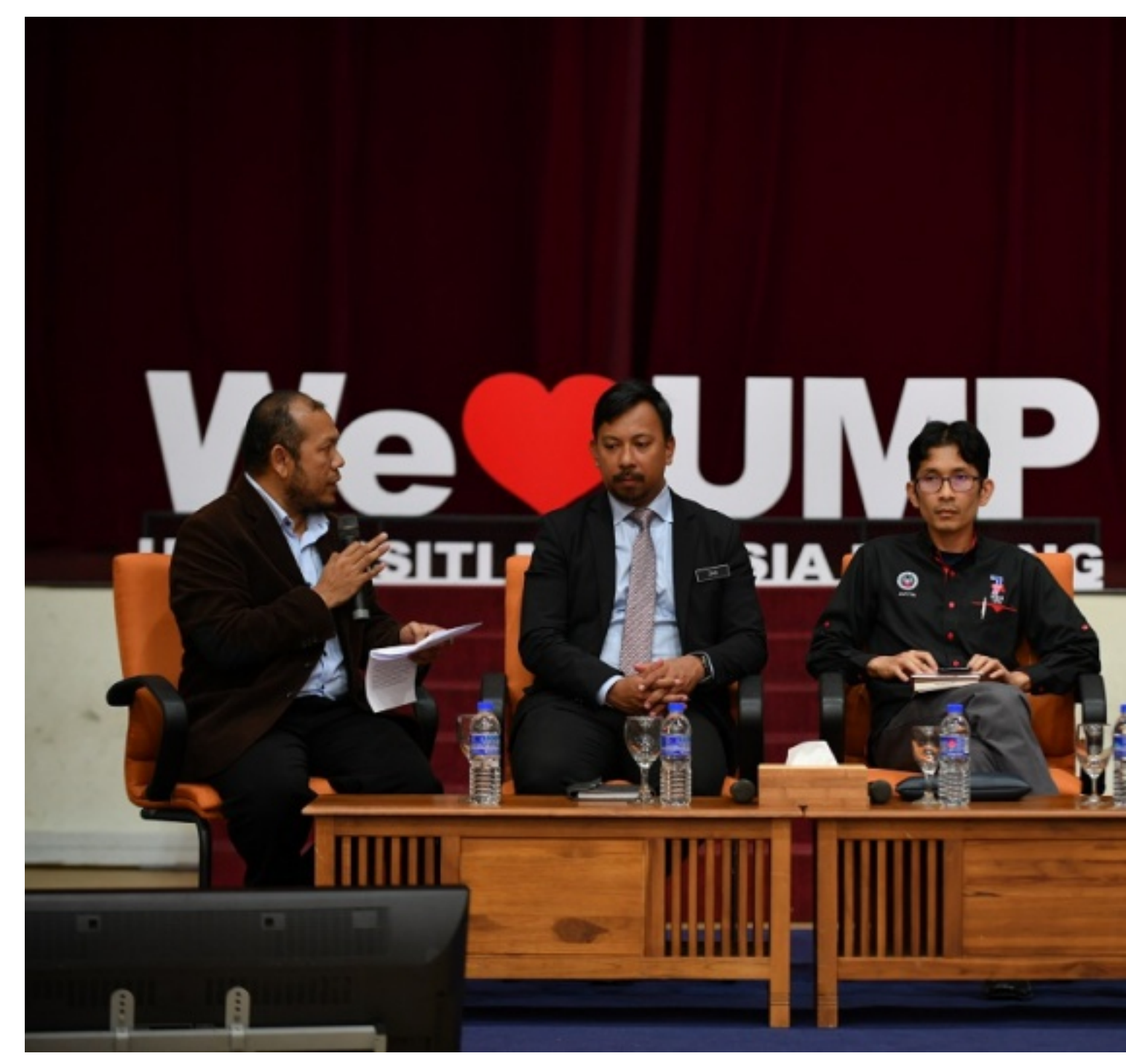
"In fact, we are told to love books and to acculturate knowledge by reading books other than the syllabus se

He noted that as a student, there was no compromise in their pursuit of knowledge.