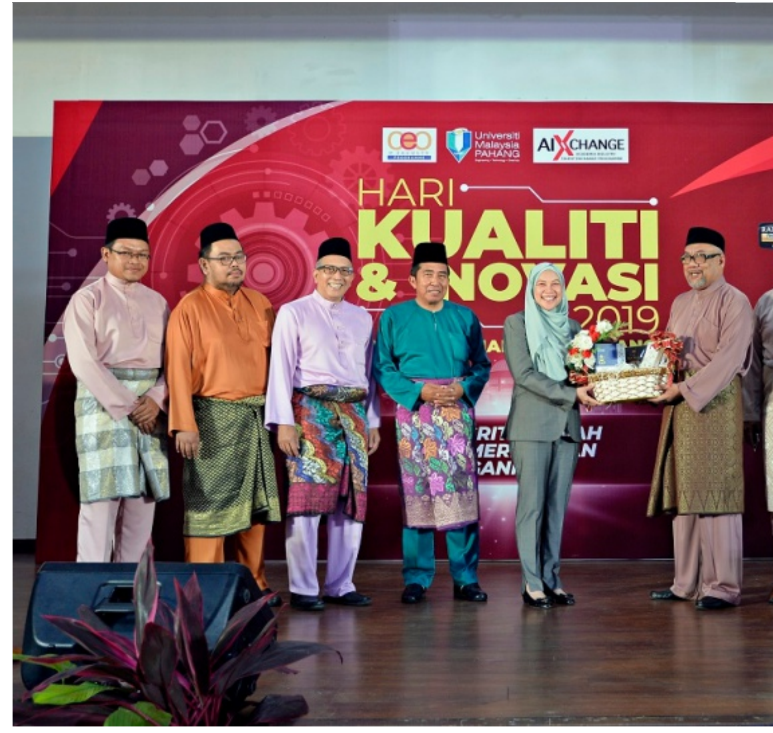
A total of 149 Universiti Malaysia Pahang (UMP) staff received the Excellent Service Award while 20 we Prize, which marked the university's recognition of their quality services.

UMP also named KRT Taman Mutiara Perdana as the Best Community Partner, a show of the un communitising technology agenda.