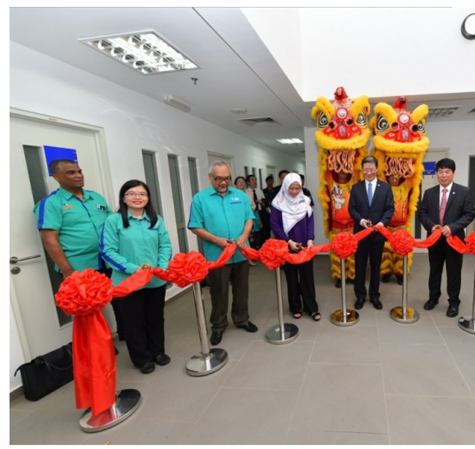
"This would further enhance efforts taken in expanding potential international cooperation, with UMP CI colvalues to students and others as well," he added.

He said UMP CI would also play a role as a service provider for exchange student programme to universit exposure and experience in culture and daily living practices as students in a foreign country and the opportorals.