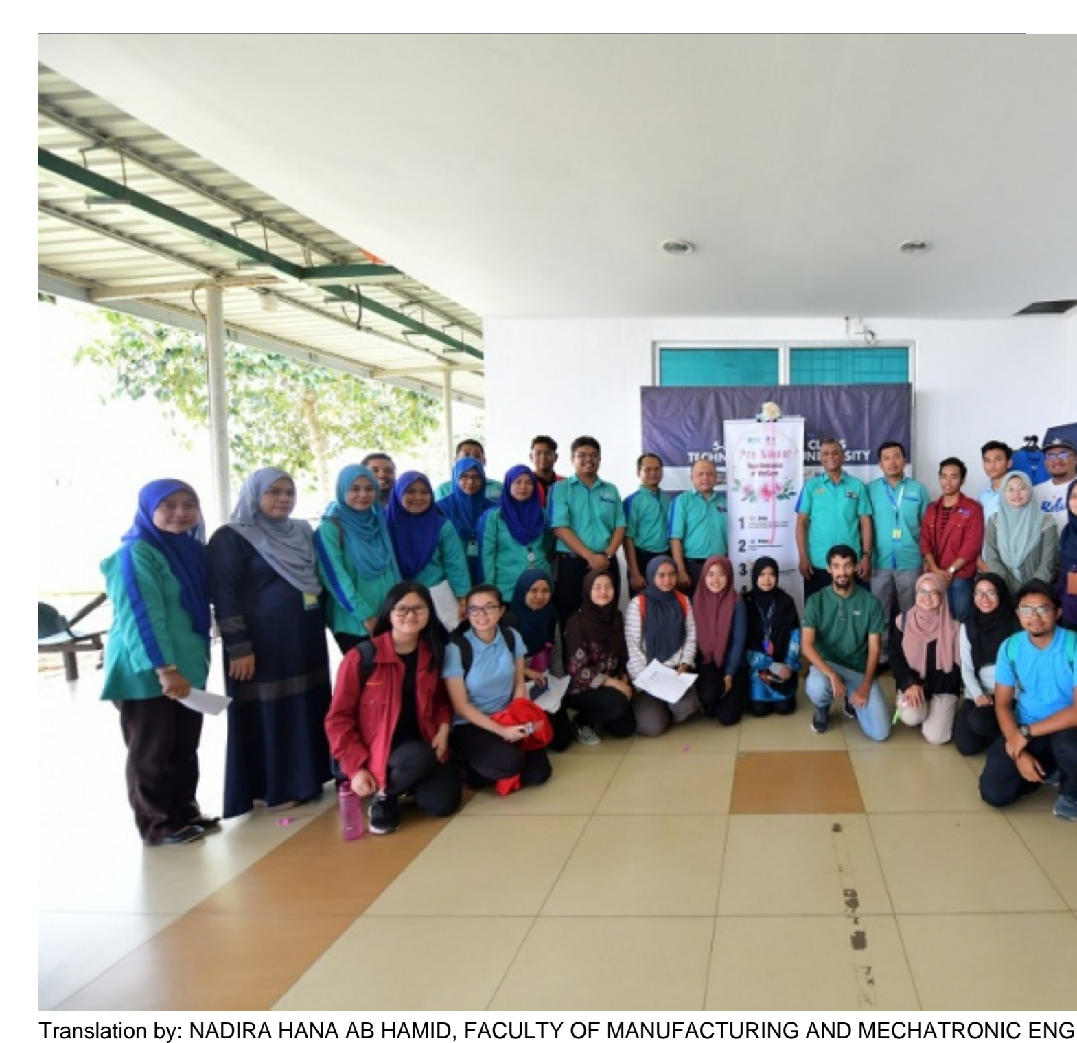
Centre for Academic Management (CAM) Open Days was successfully held in both campus Pekan and Ga It is seen as the best platform for the students to know and to get advice on the services offered for then