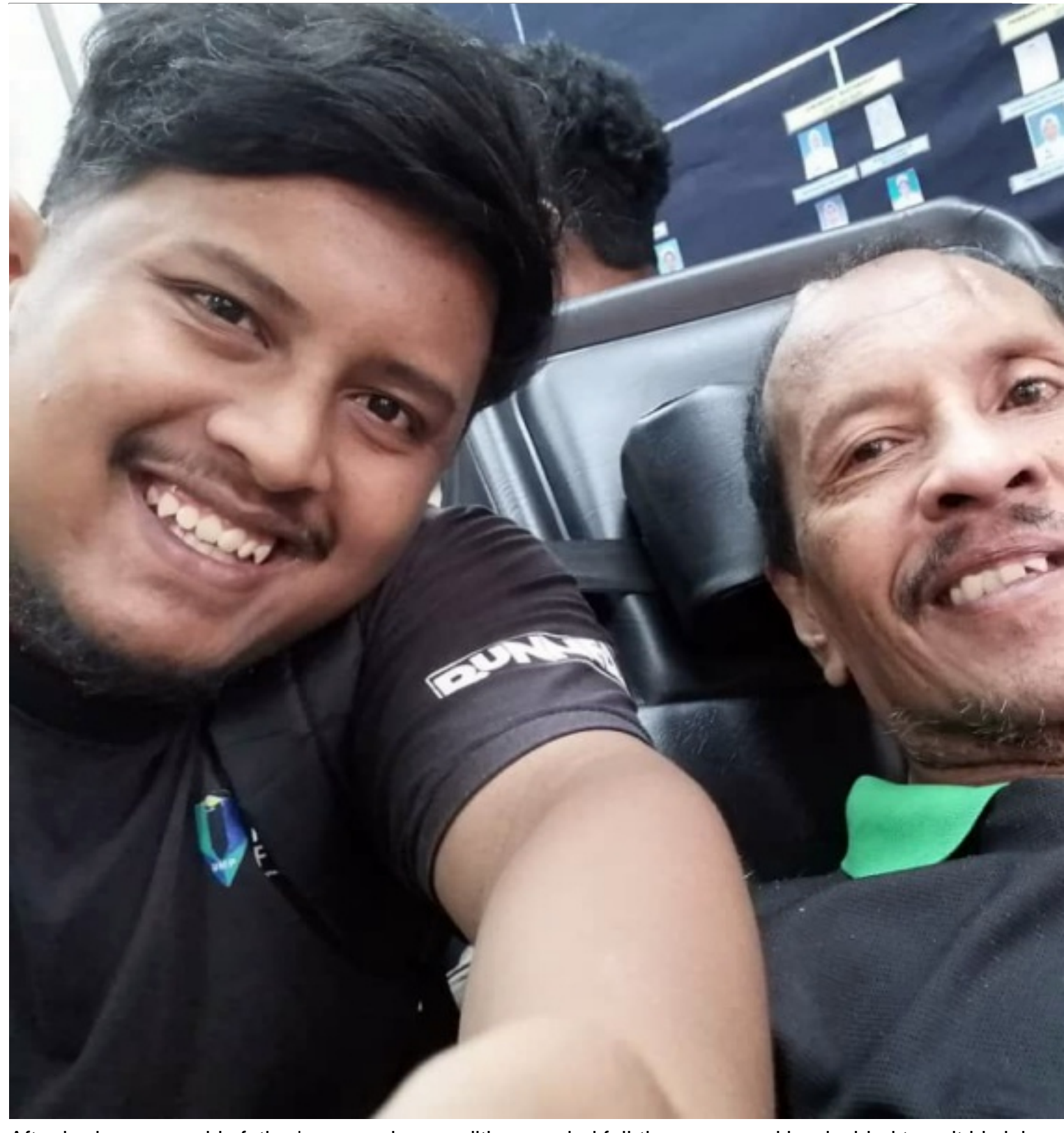
After brain surgery, his father's worsening condition needed full-time care, and he decided to quit his job.

"It needs the patience to look after my father. Sometimes it requires two people to lift him during an appoint uses a wheelchair," he said.