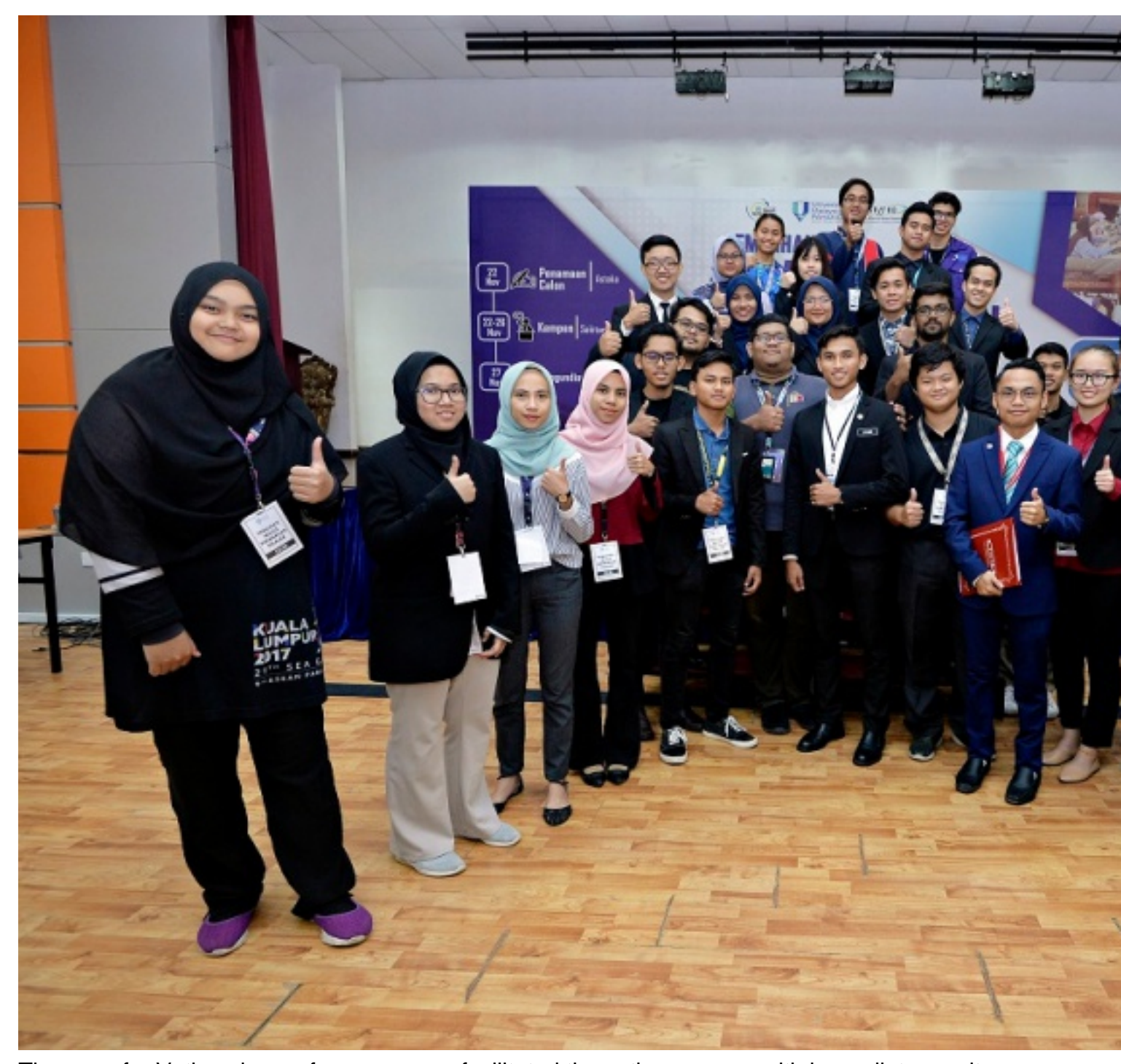
The use of e-Voting since a few years ago facilitated the voting process with immediate results.

Nine candidates emerged victorious unopposed.