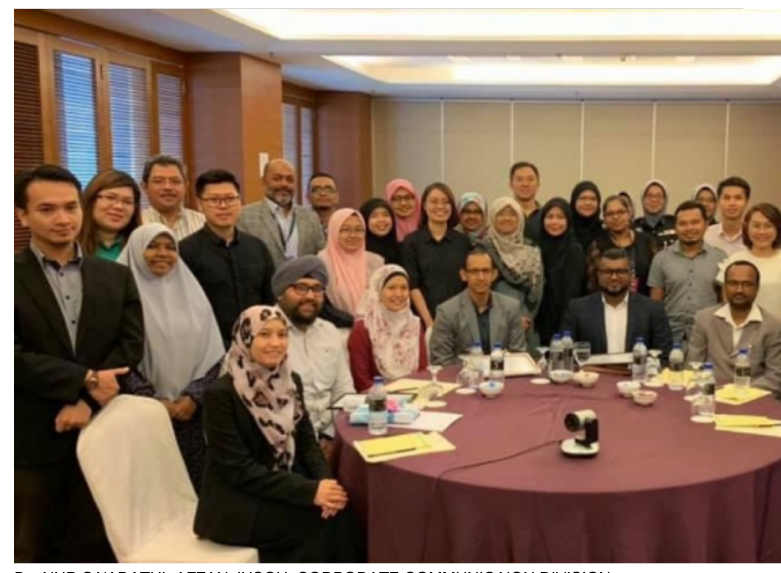
By: NUR SA'ADATUL AFZAN JUSOH, CORPORATE COMMUNICAION DIVISION

Having the means for data analysis in a business can increase the value and profit of a company in the future