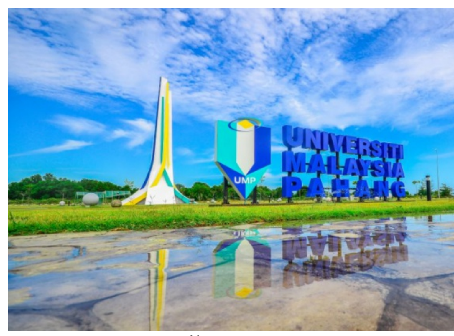
The 11 indicators used to compile the QS Asia University Rankings are Academic Reputation, En International Research Network, Citations Per Paper, Papers Per Faculty, Staff with a PhD, Proport International Students, Proportion of Inbound Exchange Students, and Proportion of Outbound Exchange Students.

The improvement covers graduate employability, networking and industrial collaboration, and international