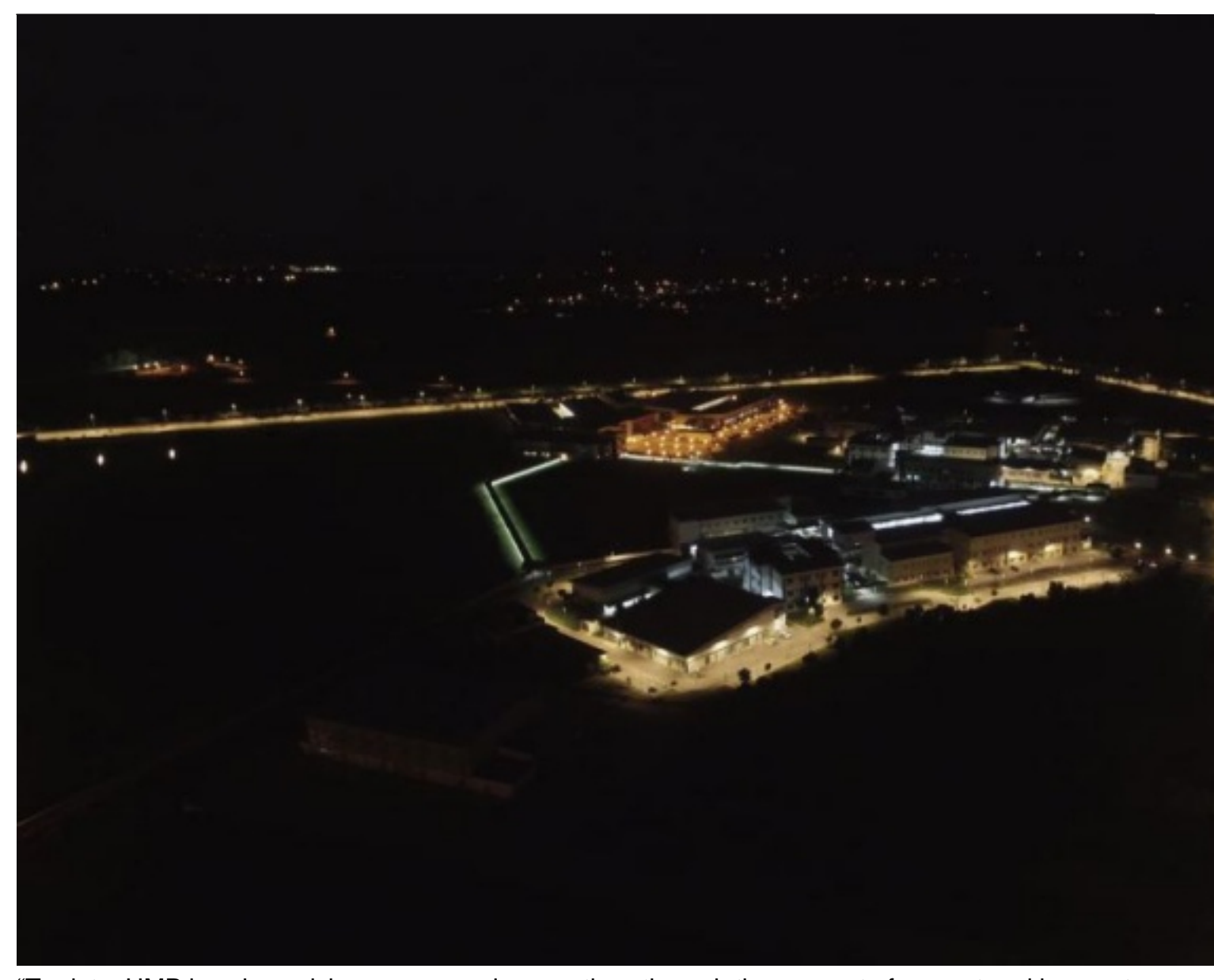
"To date, UMP is only applying energy saving practices through the concept of no cost and low cost.

"The university has managed to reduce carbon dioxide emission by 7.89 percent, which is equivalent to 8 save power up to 1,273,585 kWh at its UMP Pekan Campus.