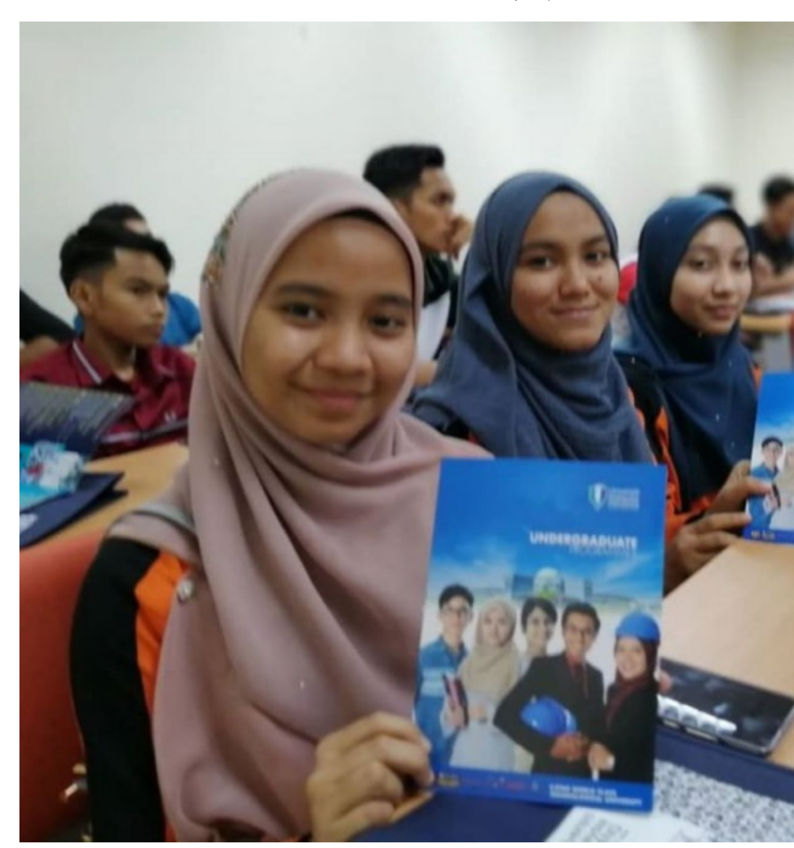
"To make it more meaningful, the students can experience the facilities in UMP, especially the technologi and learning.

"I want them to make the best choice that must be based on the entry requirements and their interests in ar