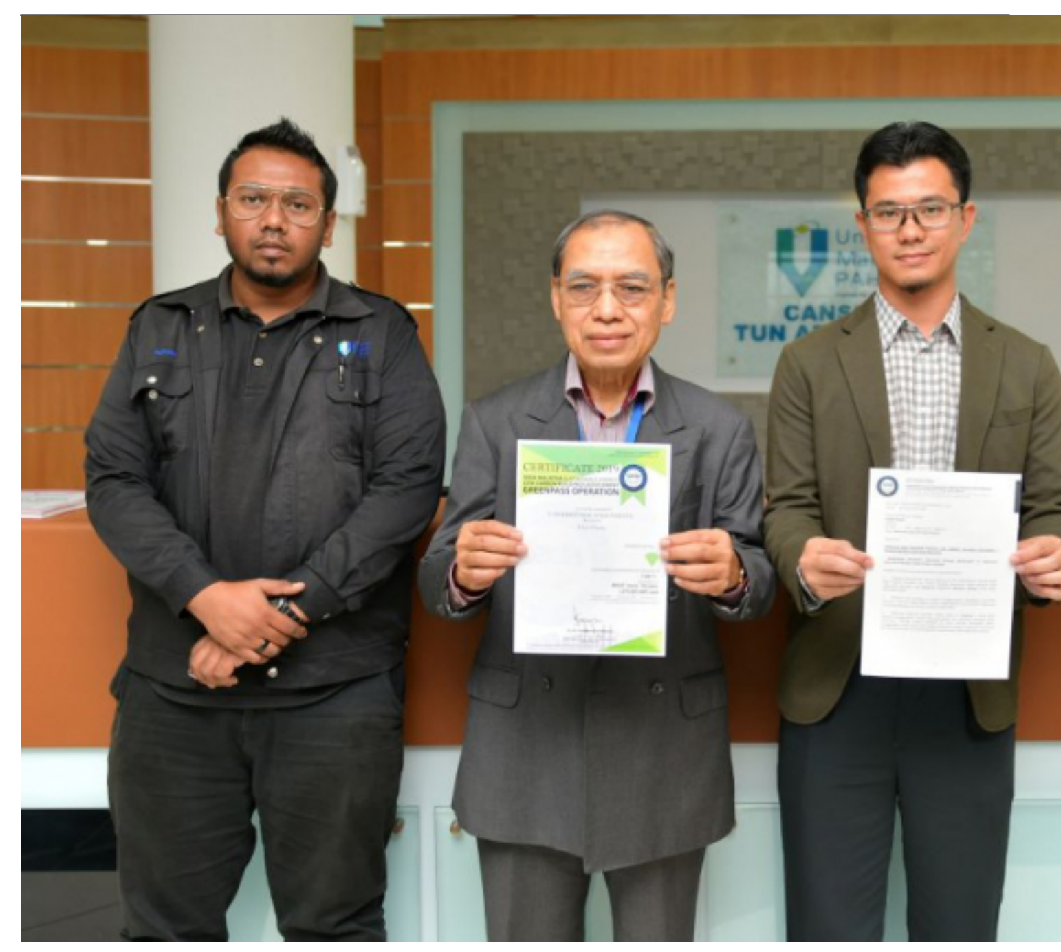
Universiti Malaysia Pahang (UMP) bagged the One Diamond Award for Low Carbon Buildings Assessment Authority (SEDA) on December 13, 2019.

UMP became the first university in the country to receive such an award for efforts taken that had succes energy consumption, the use of renewable energy and reduce carbon dioxide gas emission.