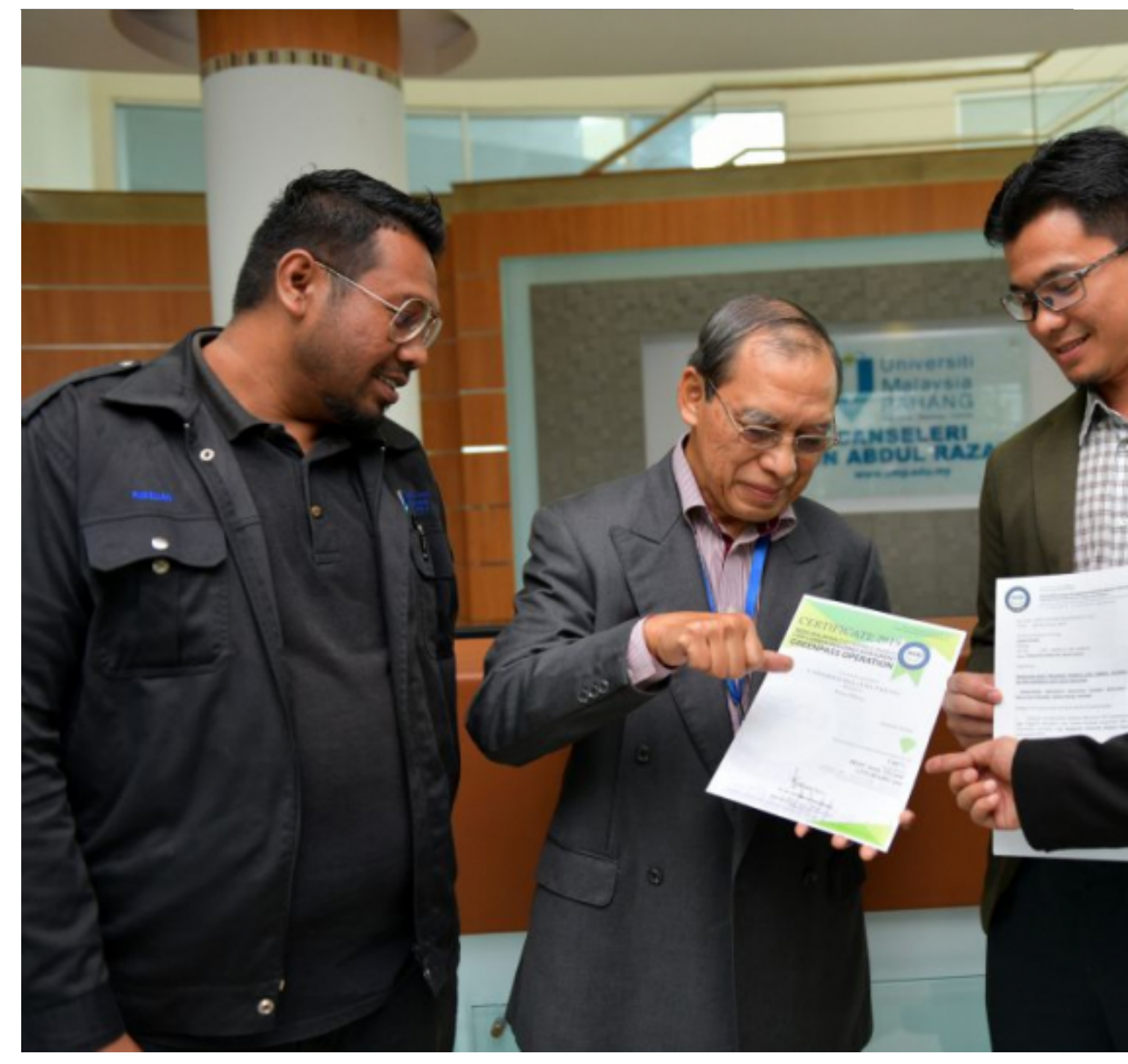
'Energy efficiency' is the ultimate goal in effective and optimal energy consumption management, thus redu

Among the 'energy efficiency' practices that can be implemented are by replacing less efficient elect decreasing burden on mechanical equipment as it requires more energy to function, upgrading the roofing having a good ventilation system and using energy-saving control systems for all electrical appliances.