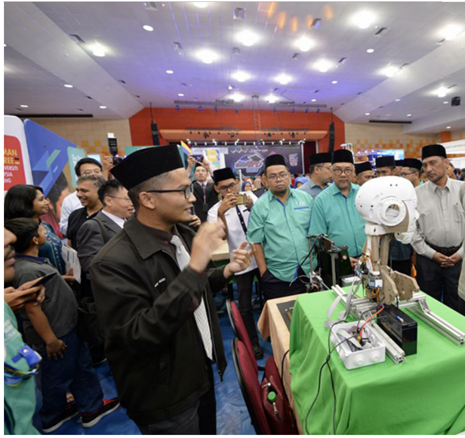
Starting the 2020/2021 academic session, UMP offers six diploma programmes and 36 undergraduate pro programmes that prepare competent and proficient students in technical areas to meet the industrial needs