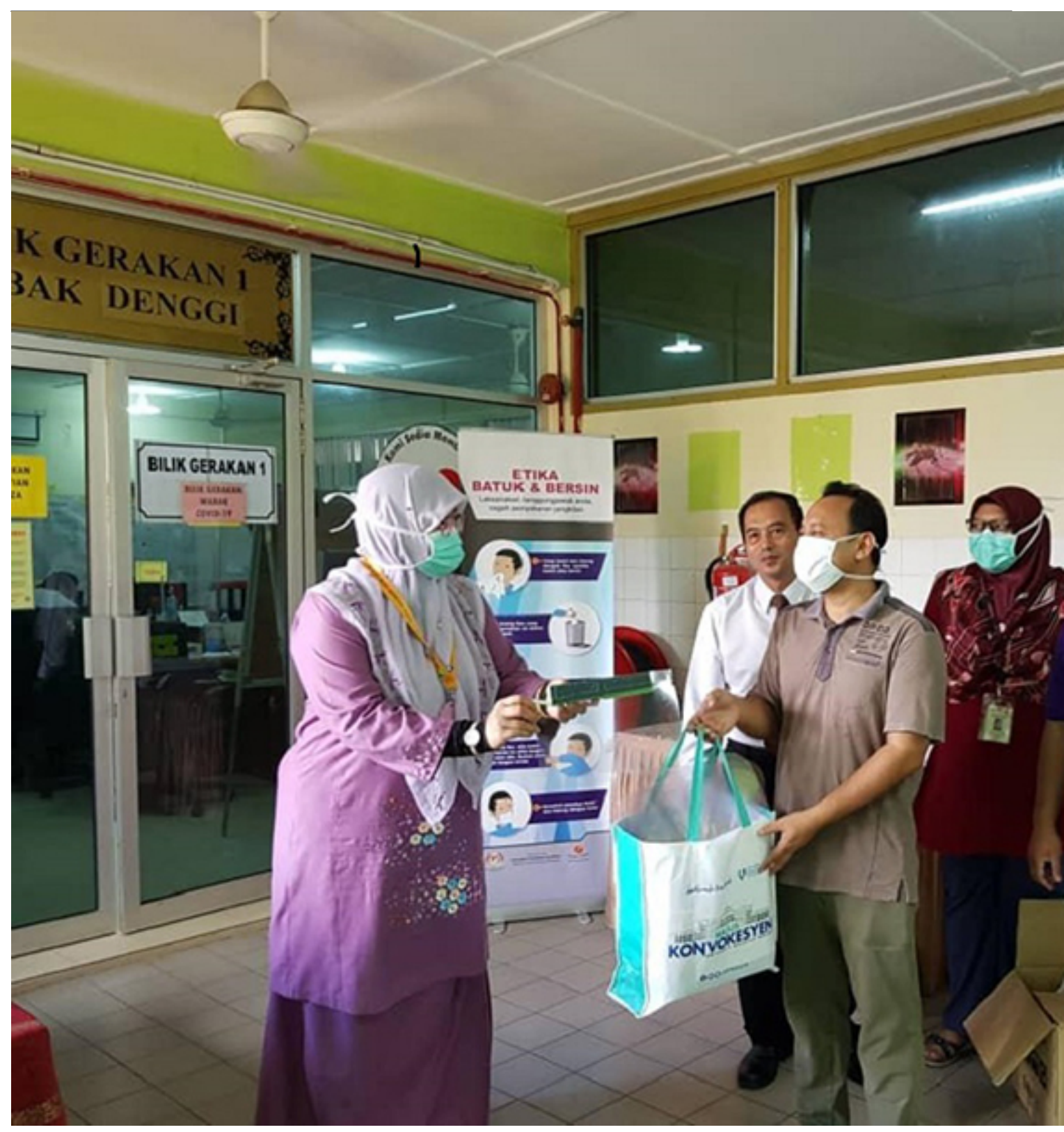
Translation by: AMINATUL NOR MOHAMED SAID, FACULTY OF COMPUTING

Acknowledging equipment such as face shields and the importance of medical staff serving hospitals treat has inspired many to produce DIY face protectors using readily available materials and can be completed q