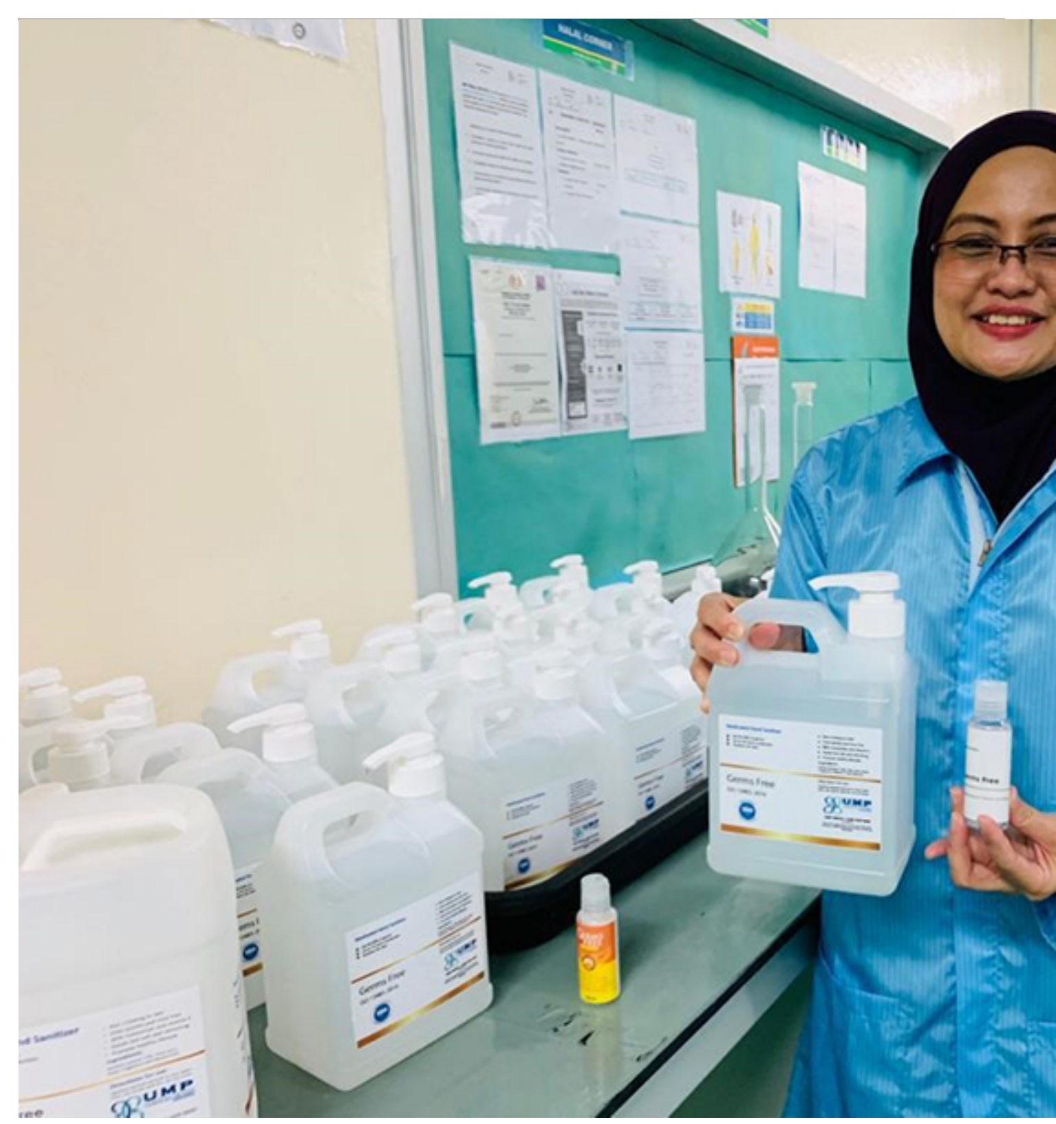
Translation by: NADIRA HANA AB HAMID, FACULTY OF MANUFACTURING AND MECHATRONIC ENG

Due to the outbreaks of COVID-19 in many countries around the globe, including Malaysia, items like dis personal protective equipment are becoming more difficult to find in the market.