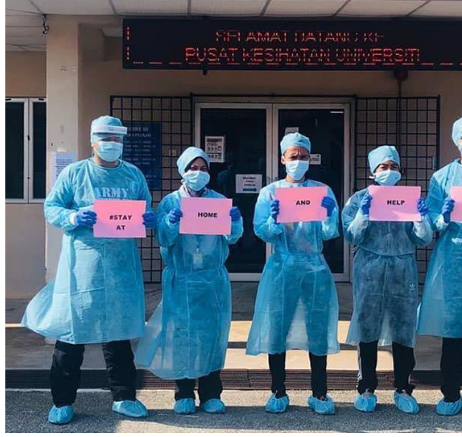
Translation by: AMINATUL NOR MOHAMED SAID, FACULTY OF COMPUTING