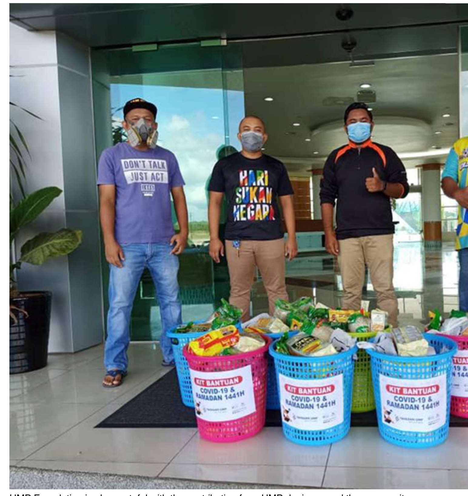
UMP Foundation is also grateful with the contribution from UMP denizens and the community.

For those who want to contribute, go to UMP portal at <a href="https://epayment.ump.edu.my/endowment/MyGi">https://epayment.ump.edu.my/endowment/MyGi</a> online through UMP Malayan Banking Berhad (Maybank) account: 556235304236 (Ref: KEBAJIKAN STAF