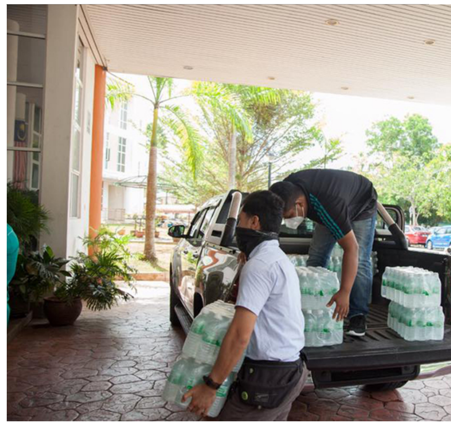
"This donation is one of the social responsibility initiatives for the community as the country faces the thr are focusing to aid the frontline who are working hard to break the virus chain," he elaborates further.

He added, this initiative is another form of community service at the moment; with each company and i burden of frontline workers in battling the spread of the Covid-19 outbreak.