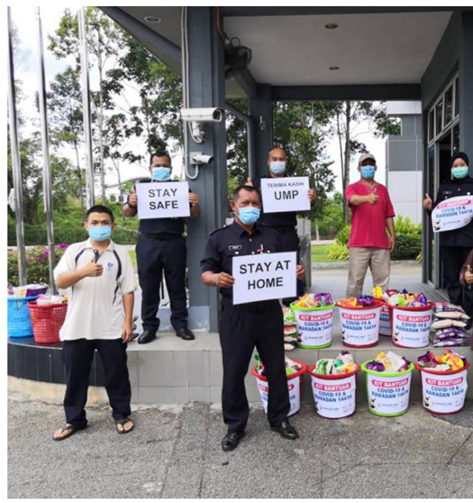
The donation is expected to ease the burden during the MCO.

In less than a week, all families are certainly busy preparing to welcome Ramadan, especially the head of t