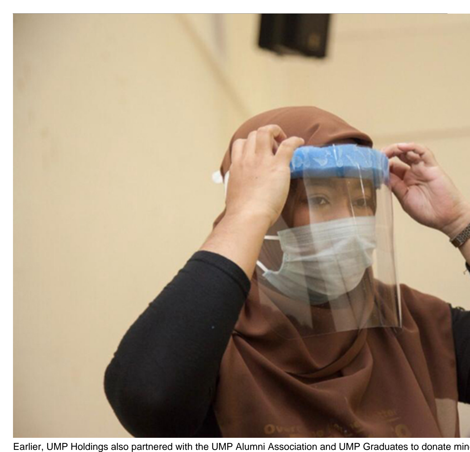
Among those who received the donations were the Gambang Police Station and the authorities involved in The mineral water is distributed weekly along with the supply of 50 bottles of 500 ml hand sanitizers to eneed.