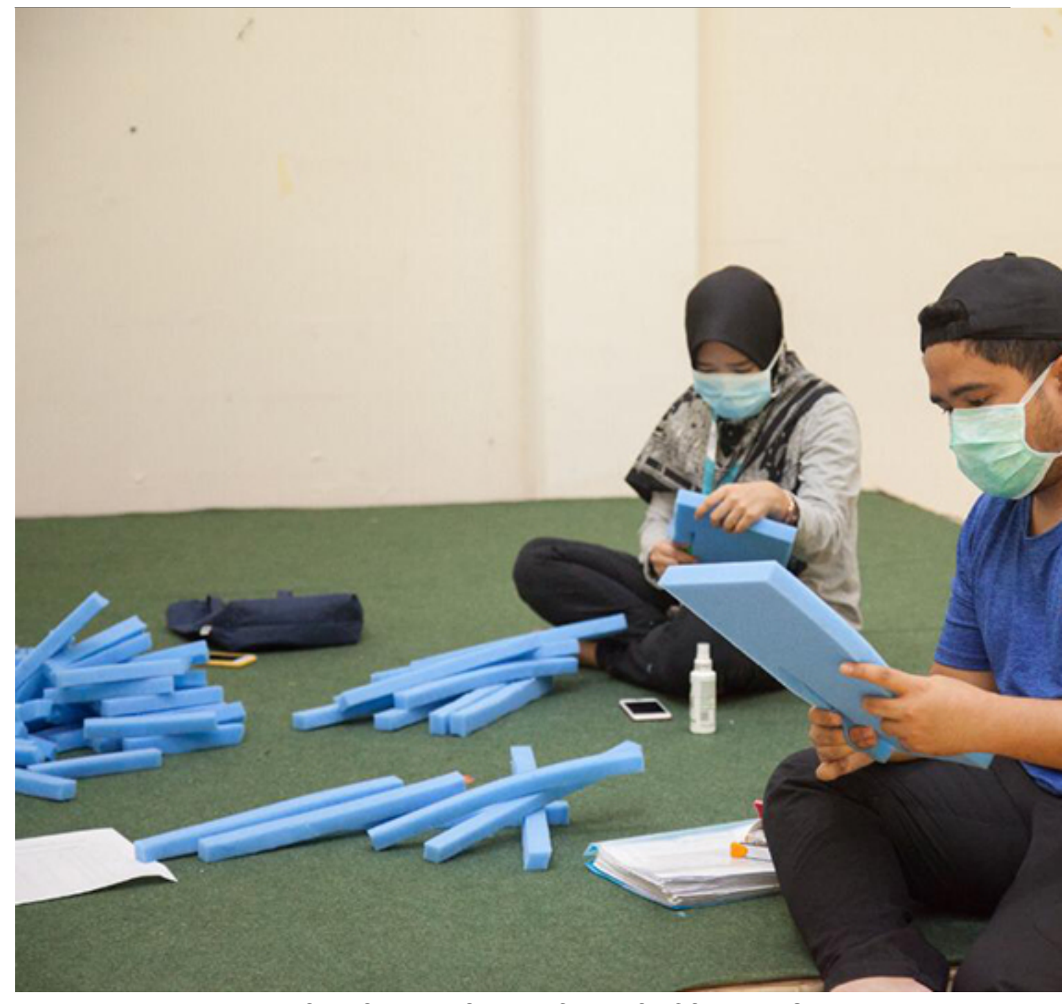
Translation by: AMINATUL NOR MOHAMED SAID, FACULTY OF COMPUTING

Concerned about the need for face protection for health and frontline workers struggling to combat the speahang state, UMP Holdings Sdn. Bhd. (UMPH), which is a subsidiary of Universiti Malaysia Pahang (UMPH) face shields at its office building on 13 April 2020.