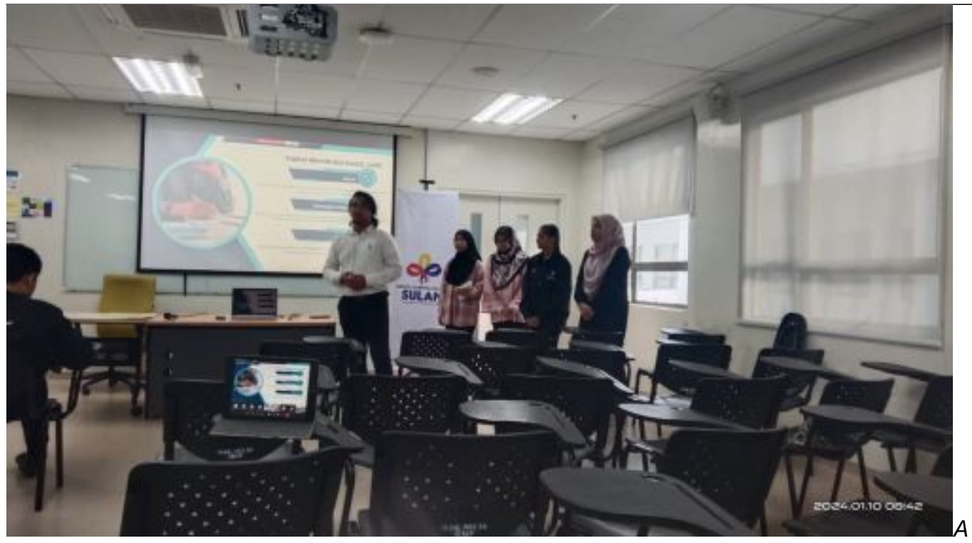
sharing session was conducted with all 12 entrepreneurs via Google Meet and live in class

Footnote: The participants have consented to their images being published