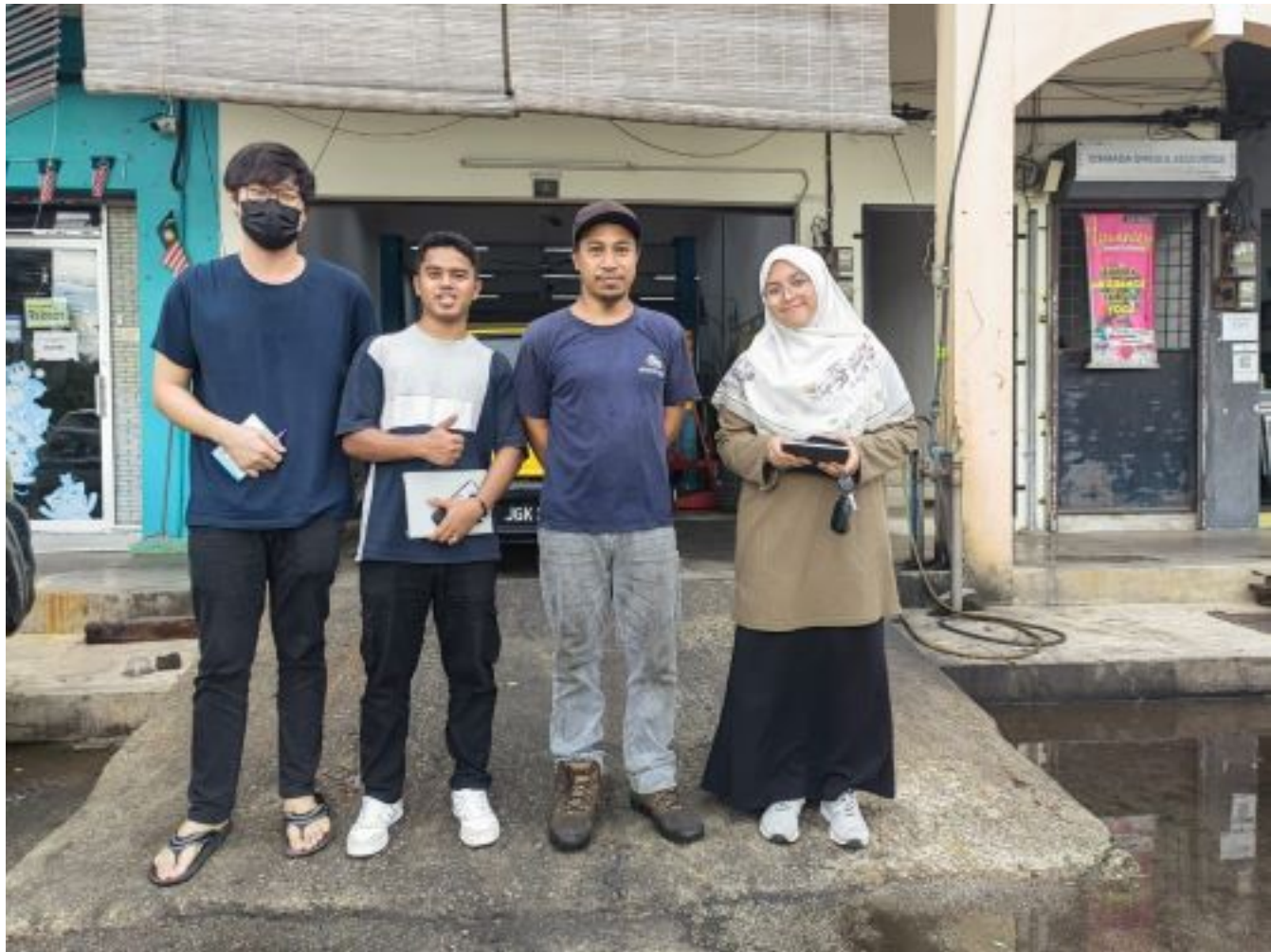
a proud stance in front of the Car and Service Workshop

Despite numerous obstacles, they were able to secure contracts, especially from the government