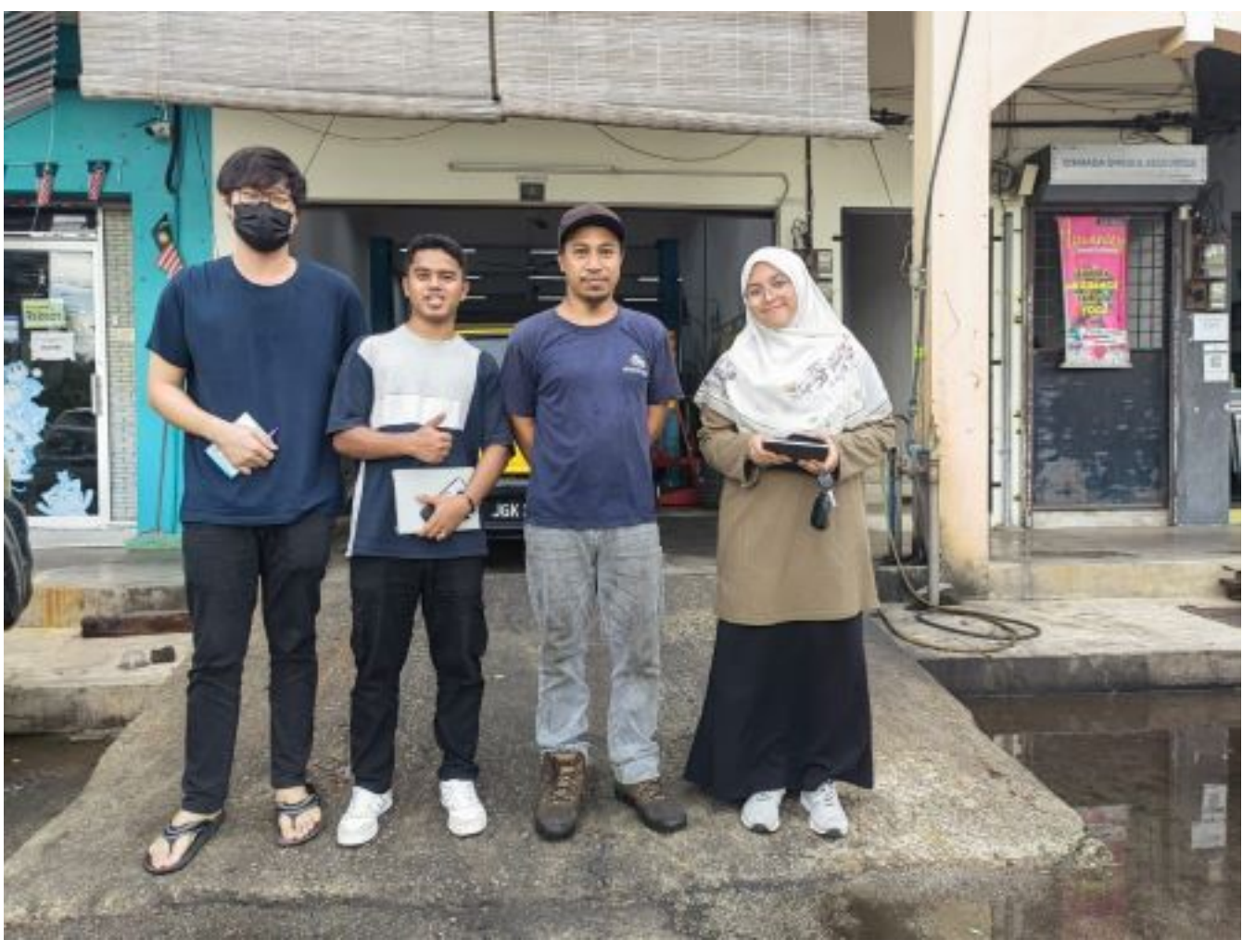
a proud stance in front of the Car and Service Workshop

Despite numerous obstacles, they were able to secure contracts, especially from the government