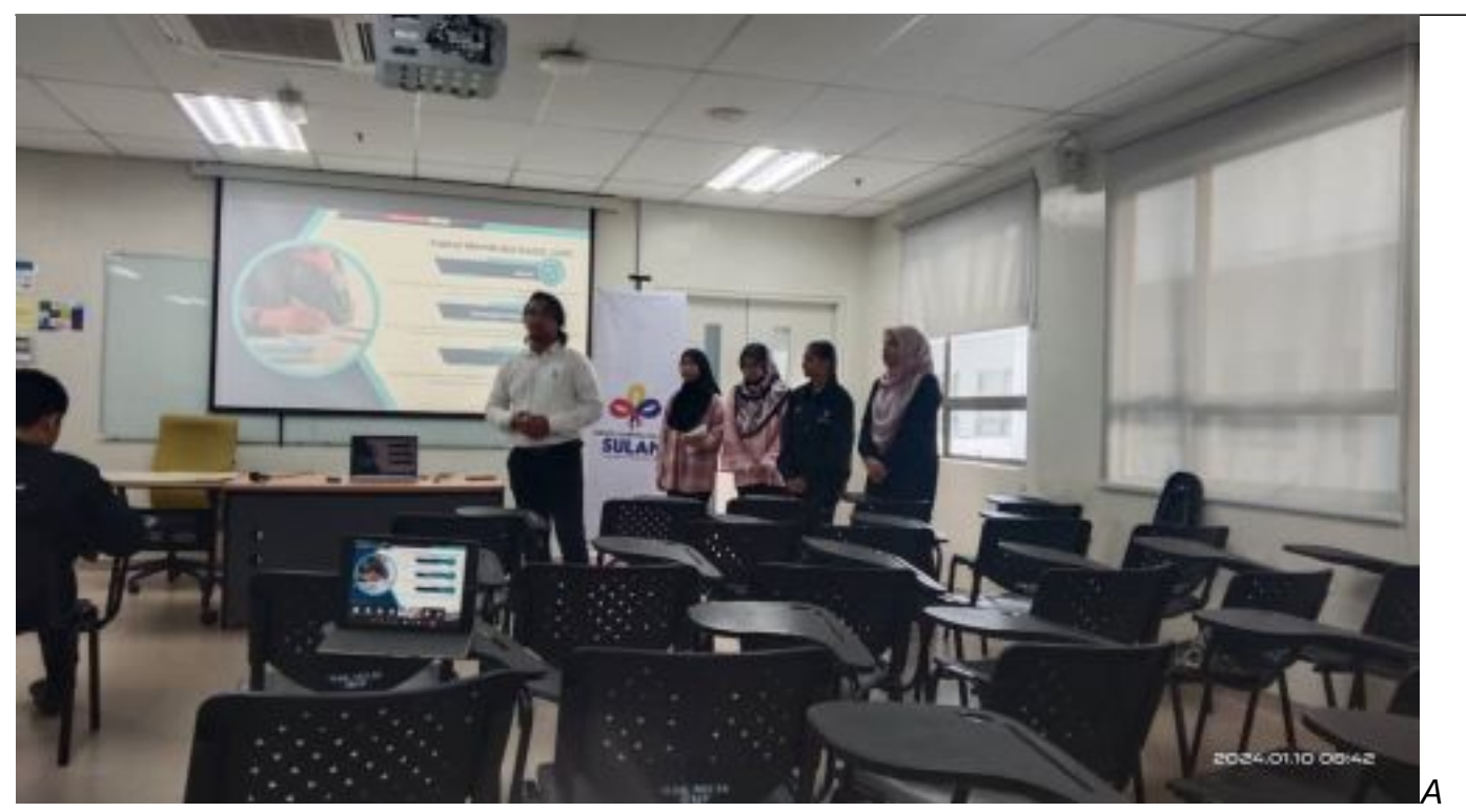
sharing session was conducted with all 12 entrepreneurs via Google Meet and live in class

Footnote: The participants have consented to their images being published