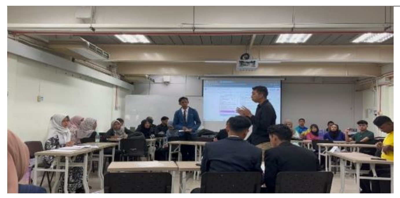
Statements are being provided by witness