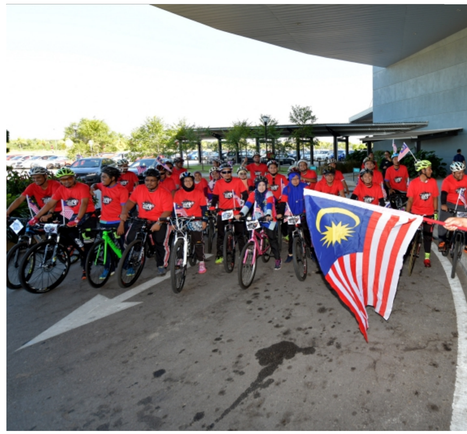
In conjunction with the celebration of 61st National Day on 31st August, UMP organizes 'Merdeka Ride' in on August 30, 2018.