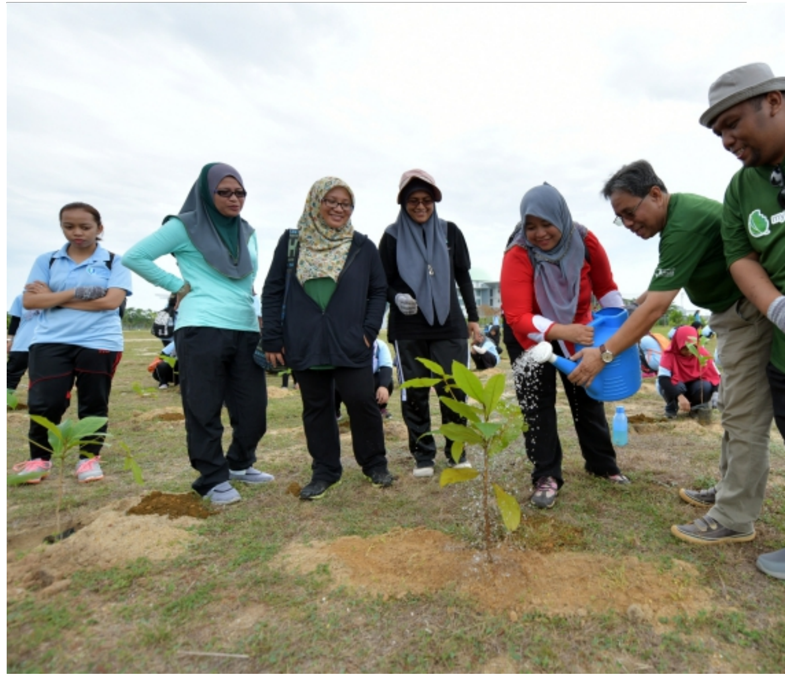
'MyTreeVolution Programme, National Forest Restoration Project' is an initiative project under the Fellow the environmental issue that need to be given attention due to the rapid developm

This project is a part of activities done in conjunction with Students Induction V