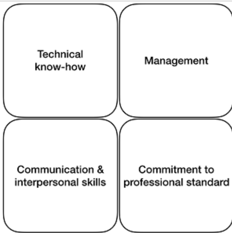
Figure 3: The attributes to be evaluated through all three routes to becoming a Professional Engineer.

The writer is a Senior Lecturer at the Faculty of Mechanical and Automotive Engineering Technology, Universiti Malaysia Pahang (UMP).